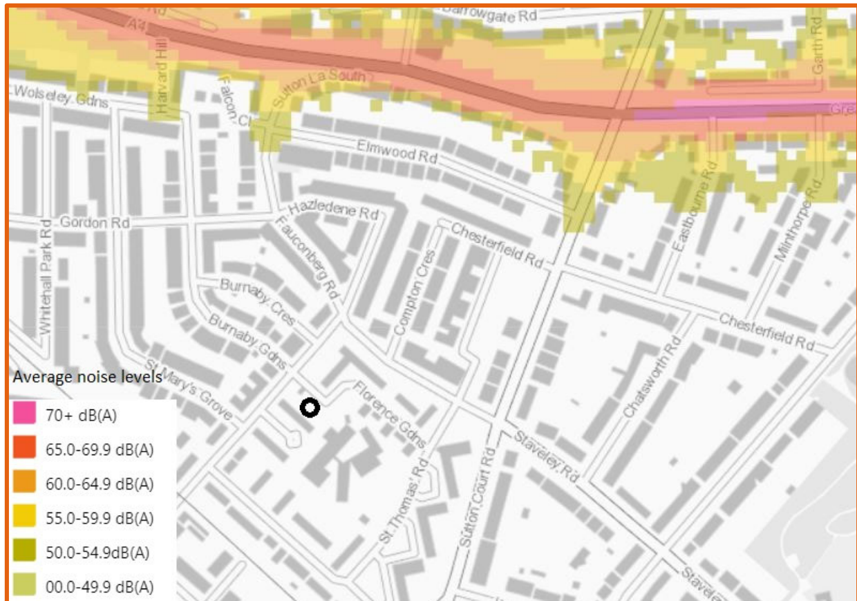
Figure 3: Defra Night road noise contour. Site 21 indicated by black marker.