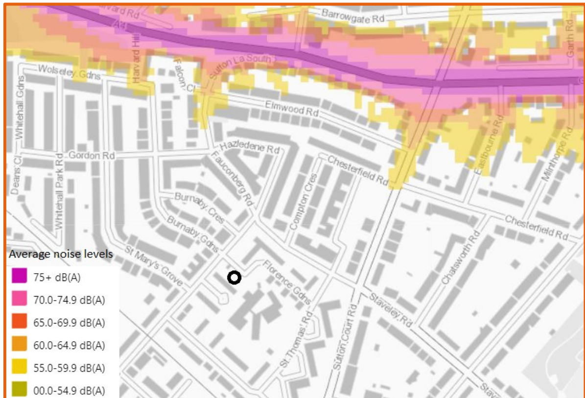
Figure 2: Defra LAeq 16-hour daytime road noise contour. Site 21 indicated by black marker.

During the daytime, road traffic noise has potential to impact on internal noise levels as well as the amenity of garden areas. Residential development could be considered acceptable but further noise assessment would be required.