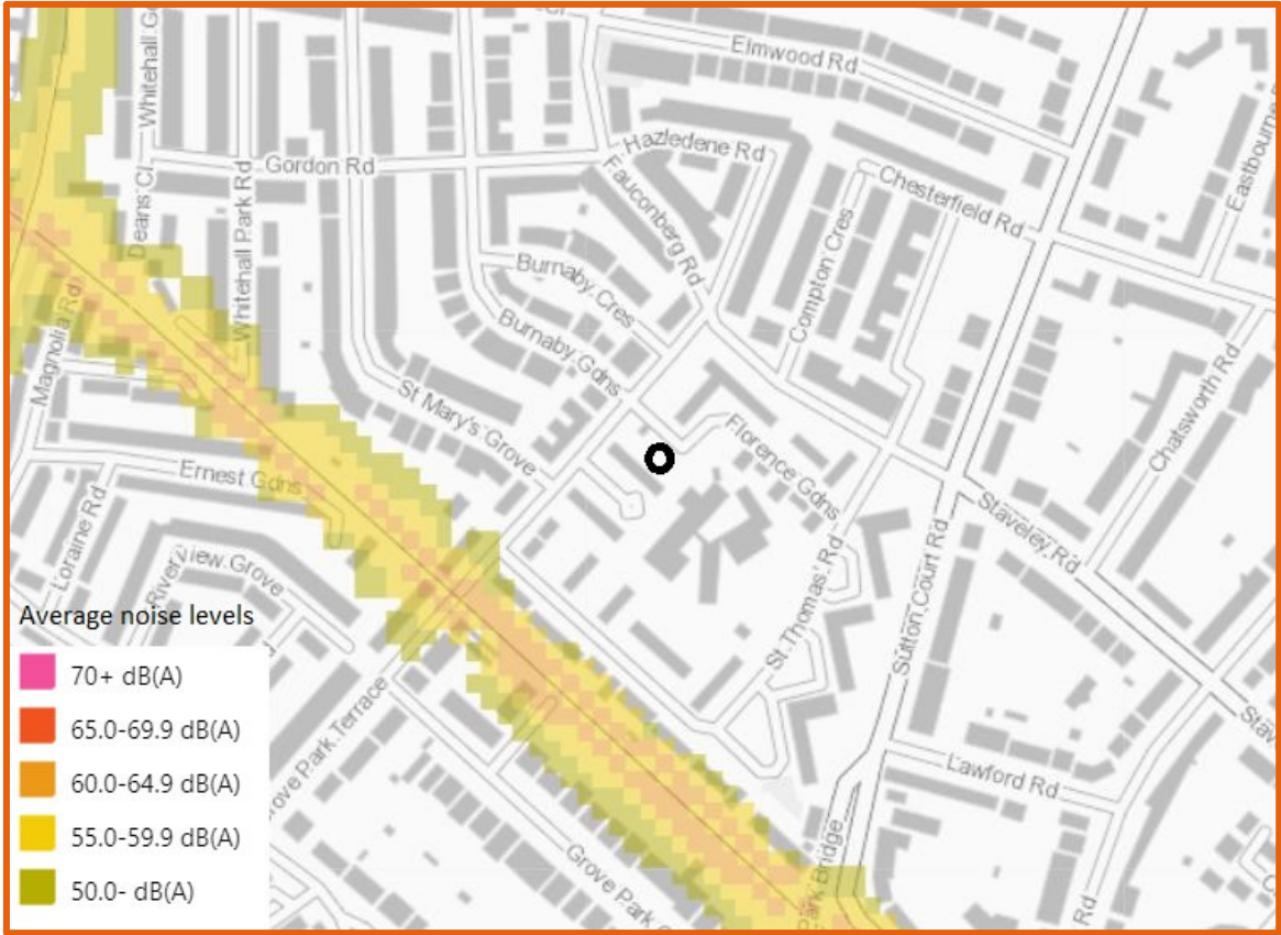
Figure 5: Defra Lnight rail noise contour. Site 21 indicated by black marker.