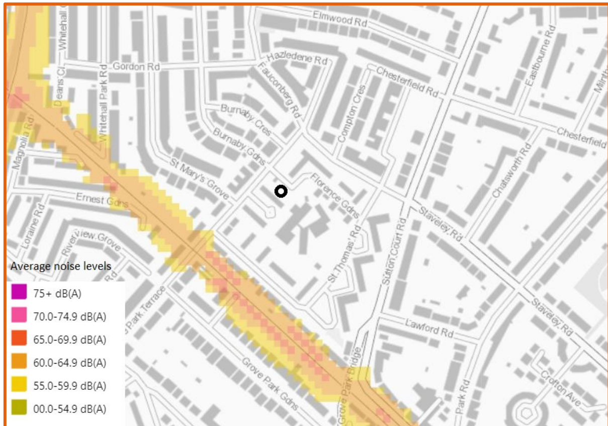
Figure 4: Defra LAeq 16-hour daytime rail noise contour. Site 21 indicated by black marker.